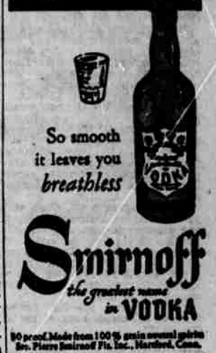
So smooth it leaves you breathless