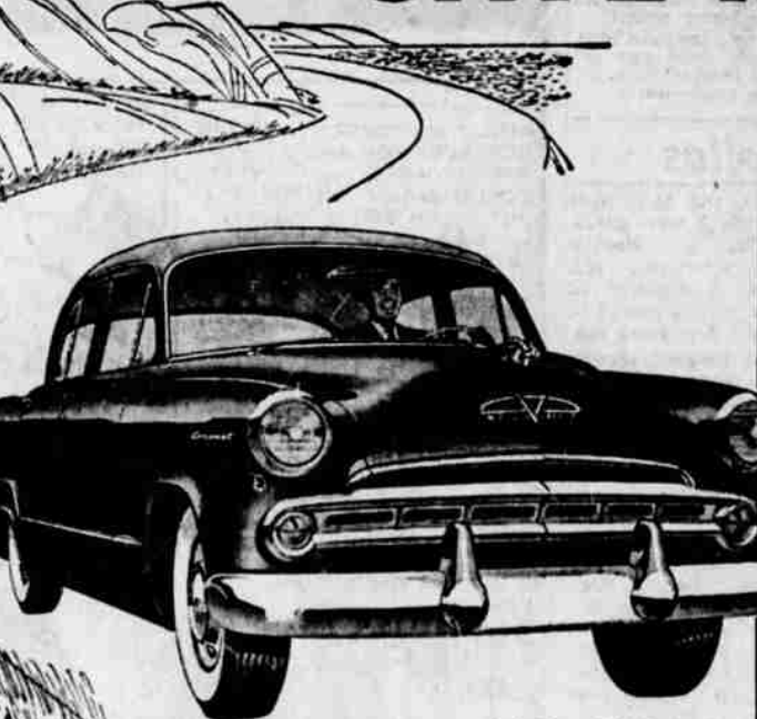
Dodge Coronet V-8 4-door Sedan

Lower Down Payments! Lower Monthly Payments! This is the Time to "Step-Up" to the Winner! Right now, your dependable Dodge Dealer offers you top trade-in allowance on your present car. It may never be worth so much again. This is your opportunity to step up to the extra power, safety and handling ease that make this '53 Dodge the Action Car of the Year. This is your chance to own the winner... to drive and enjoy the car that topped all other 8's in the Mobilgas Economy Run; streaked to new records in official AAA performance trials; won top Awards for style and beauty! Come in today. Step up to a Dodge and save!