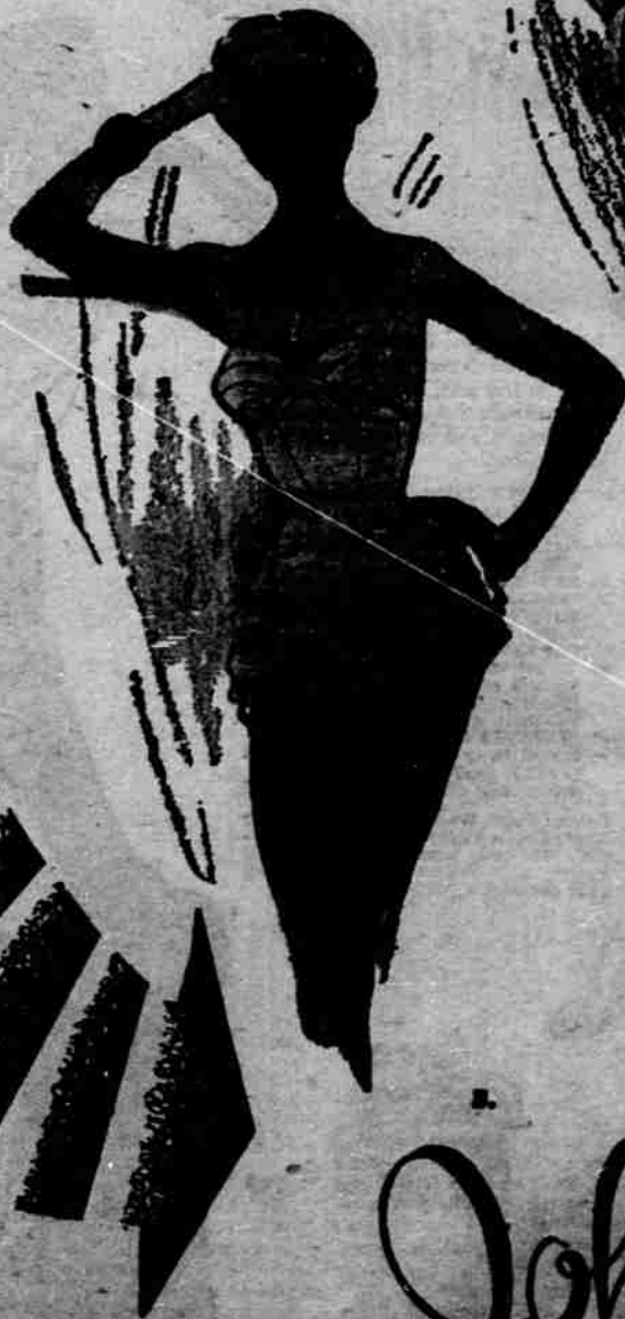
Pictured above are just two styles from our glamorous ROSE MARIE REID COLLECTION.