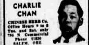
CHARLIE CHAN CHINESE HERB CO. Office Hours 10 to 8 Tel. and Sat. only 124 S. Commercial Phone 51230 SALEM, ORE.

When others fail, use our Chinese remedies. Amazing success for 8000 years in China. No matter what ailments you are afflicted, disorders, sinusitis, heart, lungs, liver, kidneys, rheumatism, sciatica, diabetes, rashes, constipation, dizziness, vertigo, neuritis, eye and bladder fever, skin, female complaints.