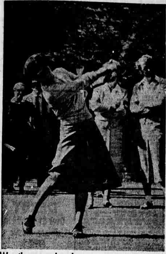
Weatherlane Leader Louise Suggs exhibits the form that carried her to victory in the San Francisco lap of the transcontinental Weatherlane Golf Tourney. Miss Suggs won the third leg with a 75-74 and also surged into first place in the national standings.