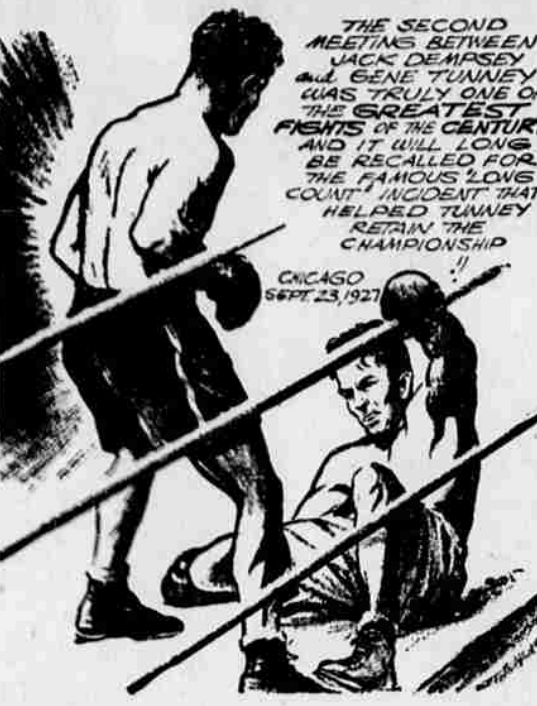
THE SECOND MEETING BETWEEN JACK DEMPSEY and GENE TUNNEY WAS TRULY ONE OF THE GREATEST FIGHTS OF THE CENTURY AND IT WILL LONG BE RECALLED FOR THE FAMOUS LONG COUNT INCIDENT THAT HELPED TUNNEY RETAIN THE CHAMPIONSHIP CHICAGO SEPT. 23, 1927