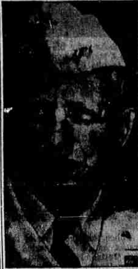
Lieut. Gen. William K. Harrison, senior United Nations truce delegate in Korea, addressed a letter to Communist negotiators proposing discussion on a resumption of armistice talks.