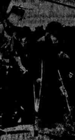
Sick and wounded Communist prisoners of war leave an LST at Pusan, Korea. Brought from Cheju, they are the first of 8033 Reds who will be turned over to the Communists near Panmunjom next Monday.