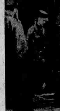
Sick and wounded Communist prisoners of war leave an LST at Pusan, Korea. Brought from Cheju, they are the first of 8033 Reds who will be turned over to the Communists near Panmunjom next Monday.