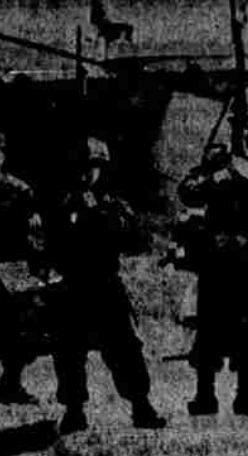
Sick and wounded Communist prisoners of war leave an LST at Pusan, Korea. Brought from Cheju, they are the first of 8033 Reds who will be turned over to the Communists near Panmunjom next Monday.