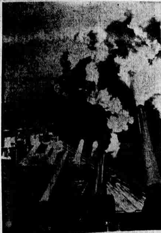
A 16-inch gun of the battleship Missouri lets go as the giant warship sails right into the harbor at Wonsan, North Korea. The Mighty Mo moved in close to bombard the Communist supply center. She is on second tour of duty with U. N. forces in Korea.