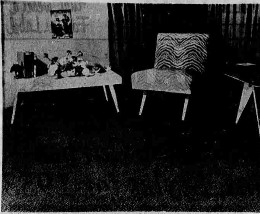
Shown here is a lovely room setting with the range of delightful carpet colors adding to its desirability. The illustration is of a Gulistan Trianon all wool Wilton feature a unique surface of varying levels of tightly looped pile which gives it high texture interest.