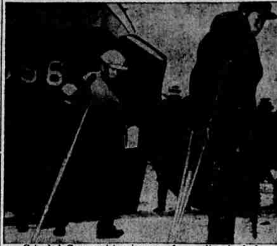
Crippled Communist prisoners of war disembark from a United Nations LST at Pusan, Korea, as they complete the first leg of their trip to repatriation at Panmunjom. They were brought from Chejudo. Some of the POWs on this LST staged a sitdown strike and refused to move until soldiers wearing gas masks and carrying bayoneted rifles came aboard.