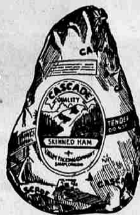
THREE CASCADE HAMS