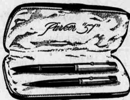
FOUR PARKER PEN AND PENCIL SETS