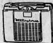
NINE Westinghouse PRIZES