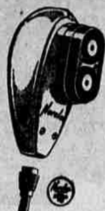
THREE New Norelco ELECTRIC SHAVERS