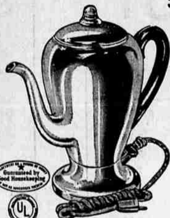
MIRRO-MATIC Electric Percolator