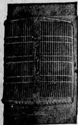
WIN A PRIZE! ASK FOR TICKETS!