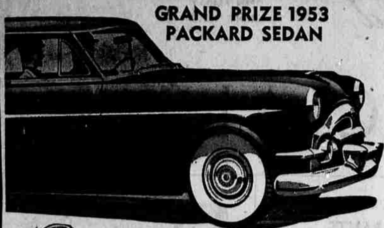
GRAND PRIZE 1953 PACKARD SEDAN

SPECIAL ROYAL CHEF PORTABLE BARBEQUE GRILL SPECIAL