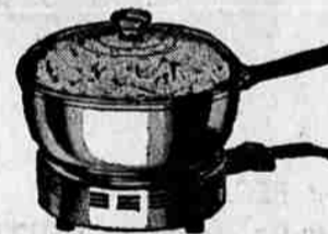
WEST BEND Electric Corn Popper THREE FESTIVAL PRIZES