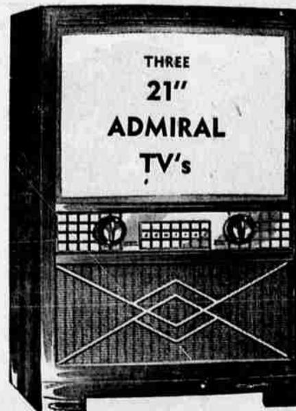
THREE 21" ADMIRAL TV's

Always . . . THE MOST OF THE BEST IN DOWNTOWN SALEM!