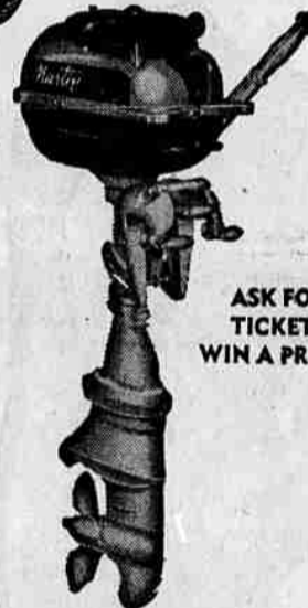
ASK FOR TICKETS WIN A PRIZE!