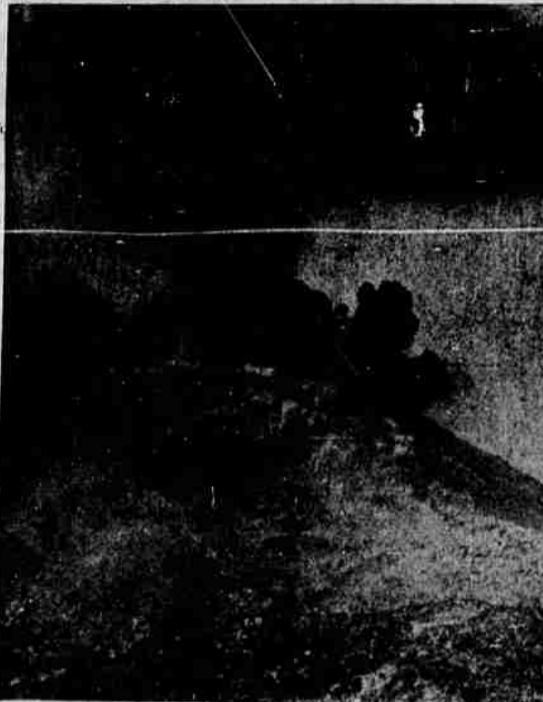
This is how bloody Old Baldy on the Korean central front looked in the cold dawn as UN artillery and planes smashed at its Chinese Communist held crest with high explosives. UN forces withdrew under a heavy Chinese attack to give the air force and artillery a clear field for destruction.