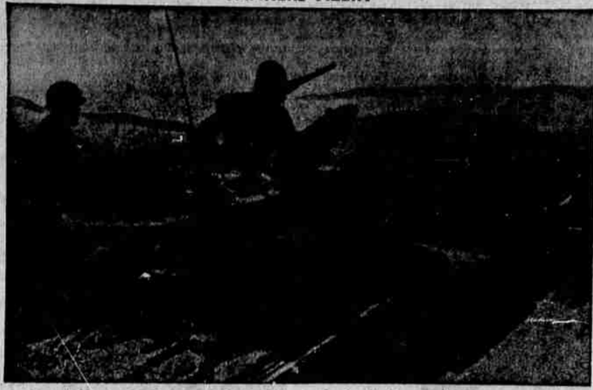
Two UN tankmen, the gun of their Patton tank aimed directly at Old Baldy on the Central Korean front, watch for enemy activity on the hill now in Chinese Communist hands