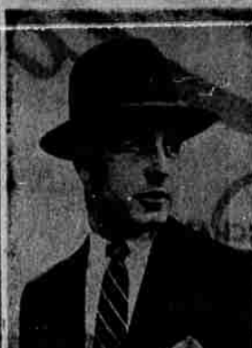
New hat shapes feature the narrow brim and tapered crown in center crease style for a youthful look.

True, style is most important in spring hats. But they have also been designed with an eye toward comfort especially for warm weather wear. No longer can men complain that hats are too heavy in the spring and summer. For spring, hats come light weight. Some weigh less than a handful of feathers.