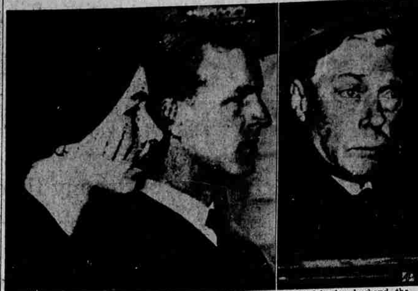
Queen Elizabeth II is accompanied by her husband, the Duke of Edinburgh (left) and the Duke of Windsor (right), eldest son of the dead Queen Mary, depart from Marlborough House. The 85-year-old grandmother of Queen Elizabeth died after a prolonged battle with a gastric ailment.