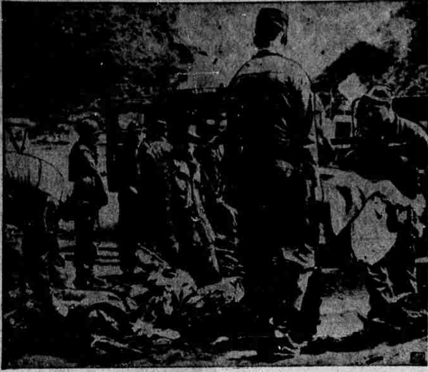
Litter bearers (right) carry the body of a UN soldier who died in the fighting on Old Baldy in Korea from an ambulance at a forward aid station as other soldiers check clothing and gear discarded by other casualties brought down from the bloody mountain. The Chinese communists launched their heaviest assault in months over the week end and heavy fighting still continues.