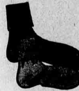
HOLLYWOOD ANKLETS 39c

Elastic leg Briefs in run proof acetate tricot. Novelty trimmed or tailored. White, colors. Small, medium, large.