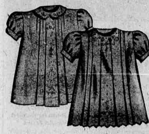
HANDMADE BATISTE DRESSES Made in Philippines 1.98 ea. All hand-sewn

Bright new novelty styles in cotton crinkle crepe. Washes, dries quickly—never needs an iron. Full-cut to Wards own specifications for easy sleeping comfort. Variety of styles in washfast colors.