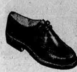
POPULAR WITH BOYS 3.98

For style, quality and sturdy wear at a thrifty price, Wards Percales are your best buy. Easy to sew into style-wise dresses, children's wear, home accessories. Pay less for this guy, washfast cotton today.