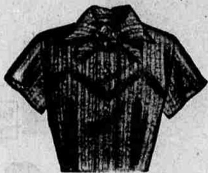
NYLON EASTER BLOUSES In White 2.98 Spring shades

Lavishly trimmed styles with filmy laces, nylon nets or embroideries. Full-cut styles that combine the beauty fiber acetate with long-wearing, quick-drying nylon. Now at Wards in frosty white.