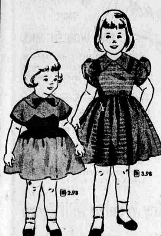
FOR SUNDAY-BEST WEAR Sizes 1-3 2.98 Size 3-6X 3.98

Polished prints or glossy solid colors in striking fashions for Easter wear. Delightfully different touches include whites, stripes and crisp sheer trims. Some have smart cinch-belts. In pastels or new rays.