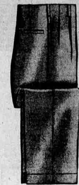
BOYS' RAYON-NYLON BLEND 4.79

Mercerized cotton with nylon reinforced heel and toe for extra long wear. Assorted wash-fast stripes. 6 to 8 1/2.