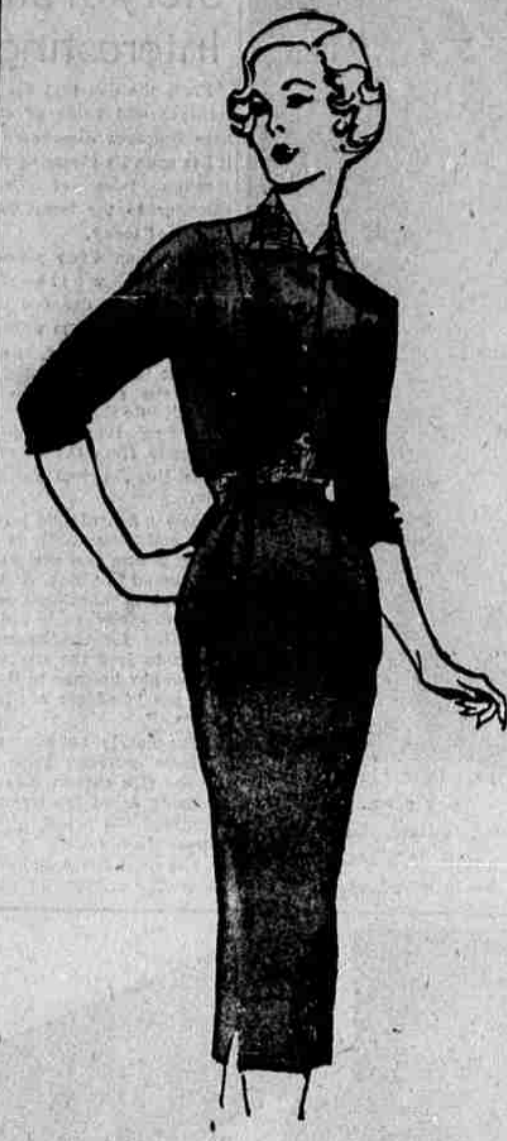
EASTER-PRETTY ENSEMBLES Juniors' Misses 9.98 Women's sizes

(A) Smart Nylon Blouses in batistes, tricot, dimities and ribbon puckered nylons. Sizes 32 to 38. (B) Washable Skirts in glazed chambrays, spun rayons, embossed cottons. Crisp styles, fine details.