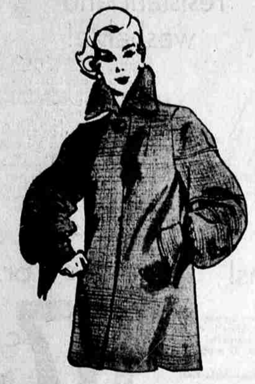
ALL-WOOL EASTER TOPPERS Spring shades 16.98 Misses' sizes

A handsome Sport Coat he'll wear often in and out of school. Smartly styled, 3-pocket model of supple, velvety-smooth pinwale corduroy. Shoutily tailored for long-lasting wear, full-cut for comfort. Lined with lustrous rayon and acetate. M a r o o n or green. Sizes 12 to 20. Jr. sizes ..... 5.98