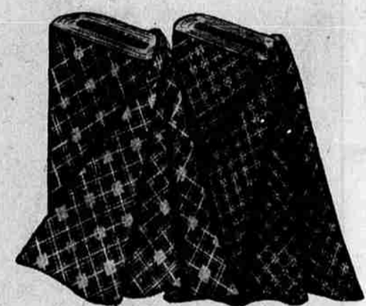
GALEY & LORD GINGHAM Fine quality 89c Yd. 38 in. width

Best Quality girls' class. Anklets. Long-wearing nylon, reinforced heel, toe. Elastic cuffs. Pastel, jewel tones. 6 to 11.