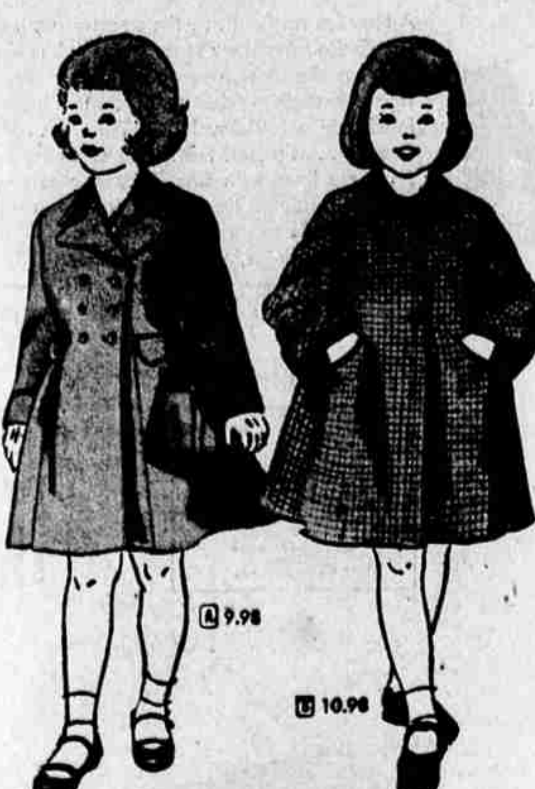
3-6X SPRING-STYLE COATS (A) Novelties 9.98 (B) All wools 10.98

Now in time for Easter, save on Spring Suits in the fashion-favored styles you want. They're rayon acetate gabardines, checks, sharkskins, stripes and flannels. Hand-finished button holes, rayon crepe linings.