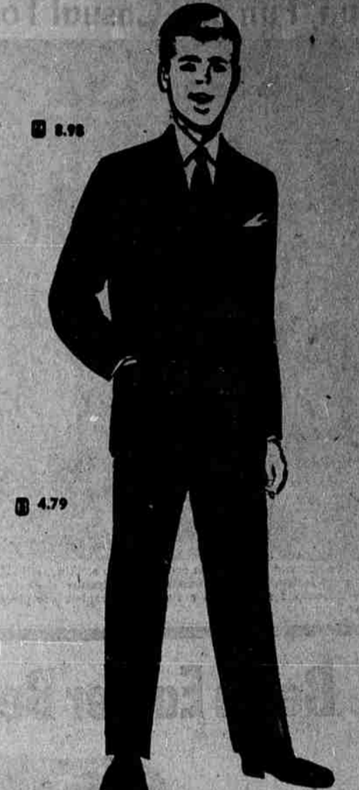
HANDSOME SPRING OUTFIT Jacket 8.98 Slacks 4.79

(A) Little sister's rayon-acetate in tailored check-and-solids with matching bag. (Fed. tax incl.) 3-6X. (B) Girls' Easter suit buys in pastel check rayon-acetates with Bag to match. (Fed. tax incl.) 7-14.