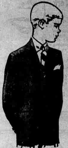
TAILORED CORDUROY 7.98

Fine, smooth, crease-resistant Gabardine of 85% rayon and 15% nylon. Notice the added smartness of saddle stitched side seams. Neatly tailored with 4 pockets, pleats and zipper fly. Spring shades of brown, blue, gray and green. Sizes 12 to 20. Jr. sizes 4-10 3.89