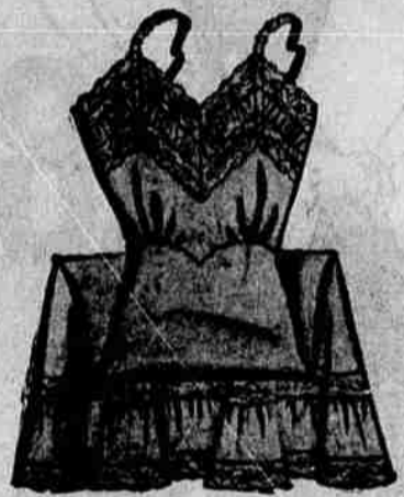
ACETATE WITH NYLON SLIPS Reg. 3.98 2.54 Sizes 32 to 44

(A) Bright, colorful houndstooth check Jacket of 50% wool, 50% rayon. Fully lined. Gray or brown. (B) Gabardine Slacks of long-wearing nylon and rayon. Four shades. Saddle-stitched seams. 12-20.