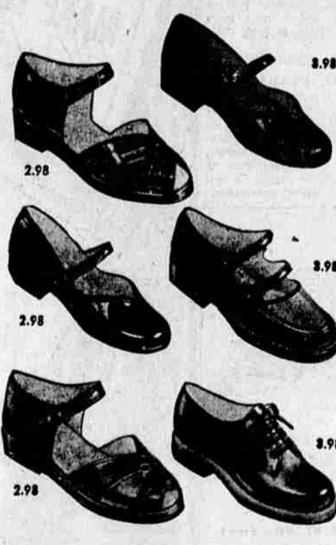
FOR YOUR CHILD'S EASTER 2.98 and 3.98

(A) Polished embossed cottons, woven stripes, combed chambrays with distinctive new trims. Spring colors. (B) Young styles in high-sheen, fine combed cotton madras. Pastel cotton in solids, stripes, prints