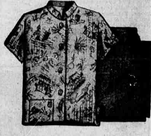
NO-IRON CRINKLE CREPE Assorted styles 2.98 Sizes 34 to 40

Buy by the box. 15 denier, 60 gauge with dark frame heels and seams that give a leg-slimming effect. Dainty stitching outlines original heel. All first quality, full fashioned. This season's newest shades.