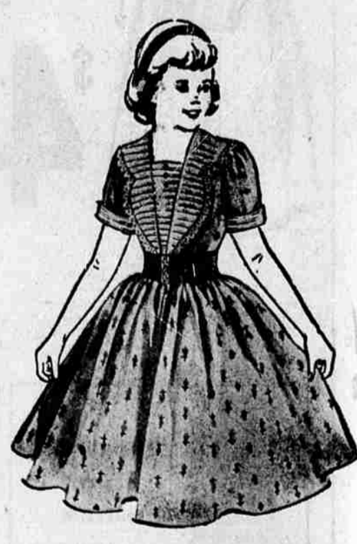
COTTONS IN FINE ARRAY Dress-up styles 5.98 Girls' 7-14

(A) Crisp rayon-acetates in sharkskins, sheen gabardines, checks. All with matching Purse. (Fed. tax incl.) (B) Fitted, flared or doll-waist types in handsome all-wool checks, fancy patterns and solid-color covers.