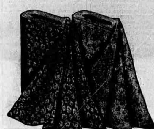
REG. 39c 80-SQ. PERCALE 3 yds. $1

Famous "Yardstick" pattern is combed and exceptionally smooth for your finest cotton fashions. Beautiful plaids and checks in new frosty tones. Crease-resistant for a lasting fresh look. Sanforized.