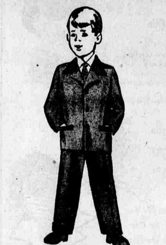
TWO-TONE CASUAL SUIT Brown, blue, green 4.98 Sizes 3-8

Wards have an outstanding selection of fine Shoes for children. Carefully made by skilled craftsmen, they fit little feet properly, and give long, satisfactory wear. A variety of spring colors. Sizes 8 1/2 to 3.