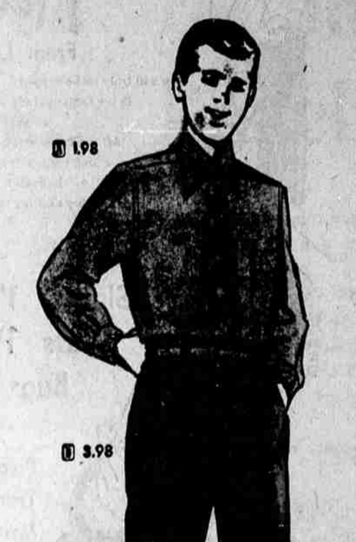
IMPORTANT SPRING TWOSOME Dress Shirt 1.98 Slacks 3.98

For Easter and long after. A well-tailored outfit of long-wearing, crease-resistant rayon-and-acetate gabardine. Boxer back longies with zipper fly. Fully lined coat with front of contrasting slub-weave.