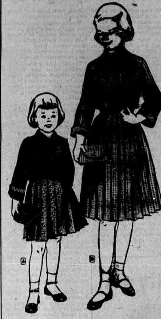
SAVINGS ON GIRLS' SUITS (A) Reg. 5.98 4.88 (B) Reg. 7.98 6.88

Convenient gripper fasteners at shoulder and at crotch for quick changes. Pants section is waterproofed by a new non-irritating plastic coating. Yellow or blue with white. Sizes for 6-12-18 months.