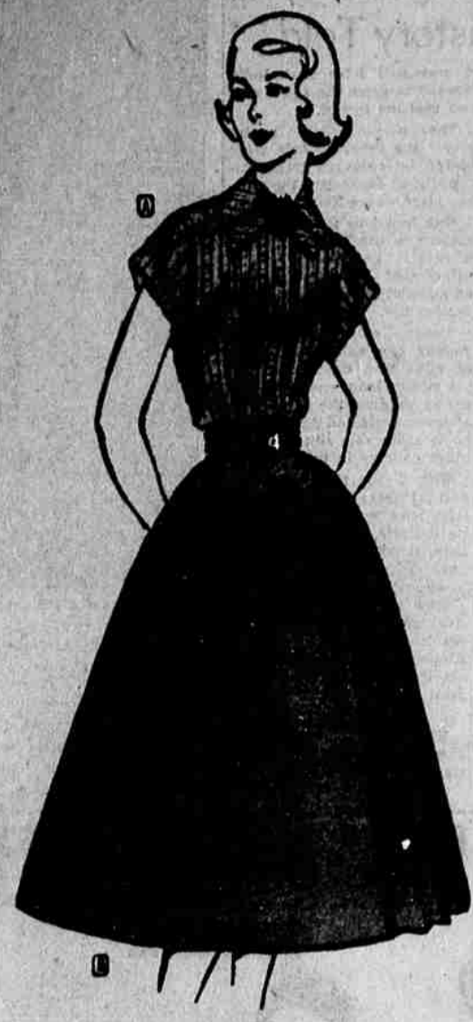
SEPARATES FOR EASTER Blouses 2.98 Skirts 4.98

(A) Smart Nylon Blouses in batistes, tricot, dimities and ribbon puckered nylons. Sizes 32 to 38. (B) Washable Skirts in glazed chambrays, spun rayons, embossed cottons. Crisp styles, fine details.