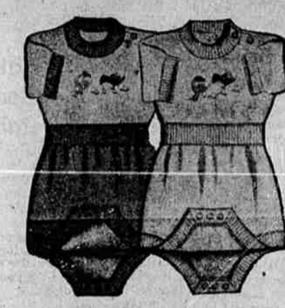
PLASTIC-LINED CREEPERS Soft knit cotton 1.39 Contrasting tops

French seams and careful hand-work on fine quality batiste in snowy white or pale pastels. All hand-done in the Philippines, including appealing touches of hand embroidery, scalloping. 6, 12 months.