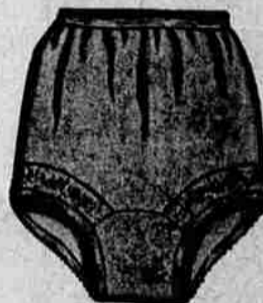
SPECIAL PURCHASE 38c pair

Pretty, time-saving nylon Blouses in new styles, sheer or opaque fabrics. You'll find nylon batistes, 15-denier nylon tricot, nylon dimities, ribbon puckered nylons. Easy-to-wash, quick-drying. 32-38.