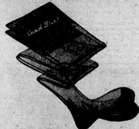
CAROL BRENT FRAME HEELS Regular 1.39 3 pairs $4 8 1/2 to 11

For just 9.98—Dresses topped with pert matching or contrasting jackets. Some with sheer redingotes. Rayon crepes, failles, butcher rayons, even acetate paper taffetas. Navy, black. Pretty all-over prints.