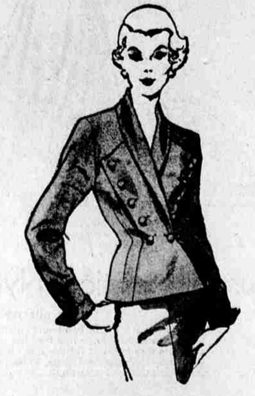
REGULAR 16.98 SPRING SUIT Misses' sizes 14.88 Junior sizes

Spring's newest styles—reflecting quality in every detail. Choose from all-wool suedes, checks, smoky fleeces or smoky suedes. Rayon taffeta lined, hand-finished button-holes. So important at every wardrobe.