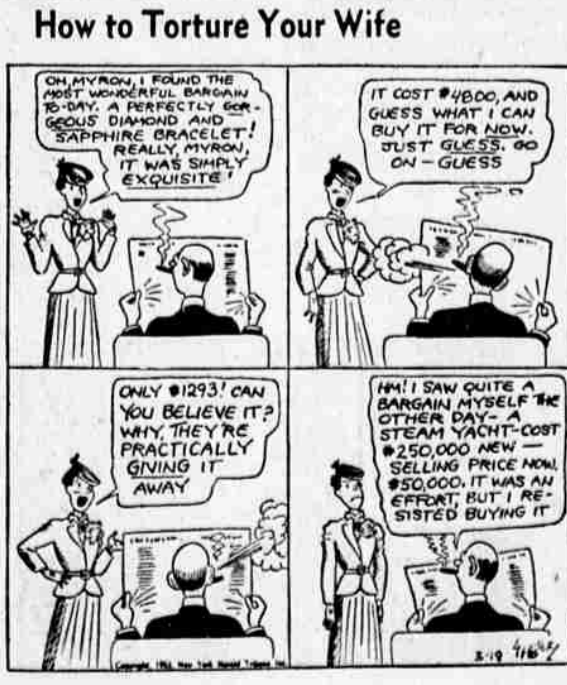
BY H. T. WEBSTER How to Torture Your Wife