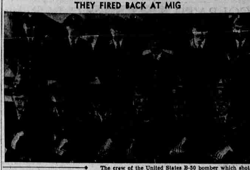
THEY FIRED BACK AT MIG The crew of the United States B-50 bomber which shot back at a Russian built MIG-15 jet fighter plane off Kamchatka peninsula, pose before their plane at Eielson Air Force base, Alaska, recently.

Compiled from reports of Salem Dealers for the assistance of Capital Journal readers. (Revised daily.) Retail Food Prices: Rabbit Petites — 33.95 (90-lb.) base, $4.90-5.70 (100-lb. base).