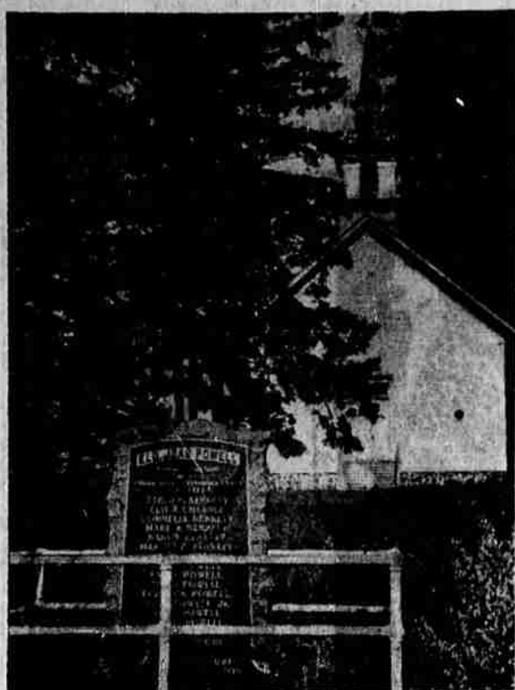
Lebanon—Providence church and its fir-guarded cemetery, now one of few remaining examples of the typical frontier church, is again the center of controversy as some of the congregation seek to deed it to the First Baptist church of Albany. A meeting will be held there at 2 p.m. on March 20 to act on the proposal. The original church was built a century ago by Circuit Rider Joab Powell.