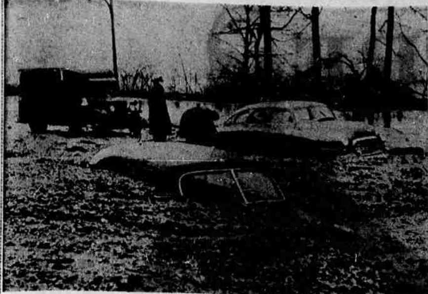
These motorists headed for the hills on foot when their autos were suddenly swamped by heavy rainstorm that hit the New York area. It was one of heaviest rains in 10 years. Police are attaching tow line to one car but car in foreground had to await a bulldozer to be plowed out.