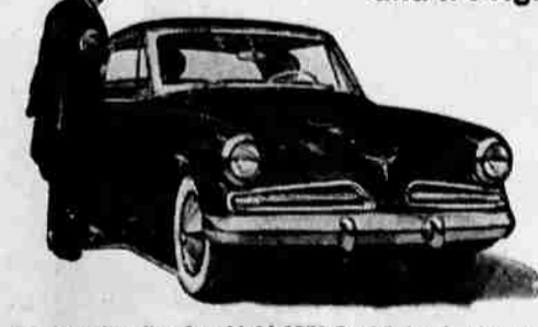
It's less than five feet high! 1953 Studebaker hard-top!

It's almost unbelievably low! It's impressively long and wide! It has the sleek-lined smartness of a costly foreign car and it's right down to earth in price!