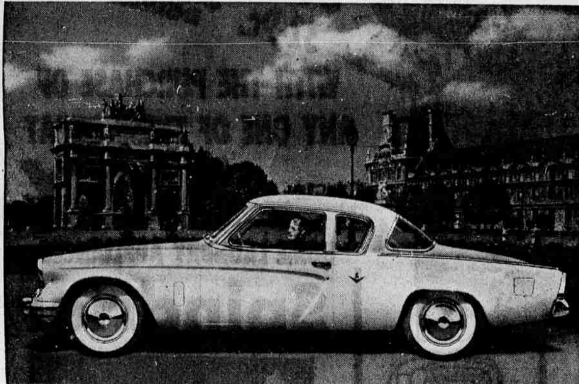
1953 Studebaker Commander V-8 Starlight Coupe. White sidewall tires, chrome wheel discs—and glass-protecting tinted glass—optional at extra cost. Actual photograph.

Presenting the New 1953 Studebaker The new American car with the European look!