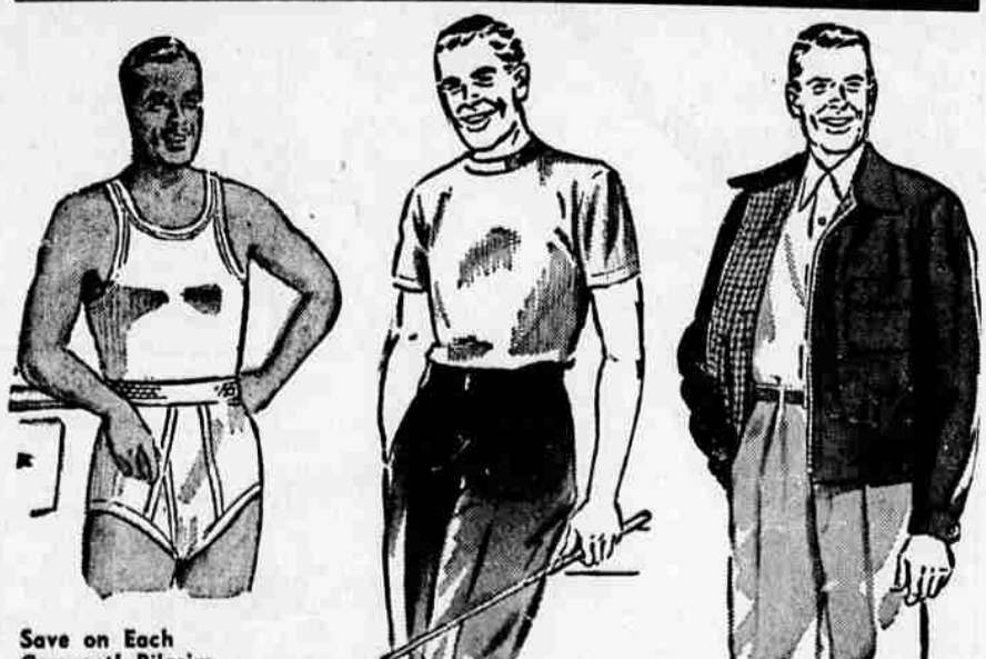
Save on Each Garment! Pilgrim shirts and briefs

Reg. 1.29 Hercules . . . . . 1.00 Low in price — but built for service! Blue cotton chambray work shirts. Bar-tacked at points of strain. At Sears now!