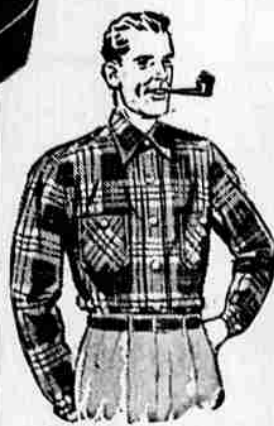
Men's Sport Denim Work Shirts

Reg. 1.98 . . . . . 1.66 Colorful, washable sport denim in handsome matched plaids. Sanforized—max. shrinkage 1%. Sizes 14½-17.