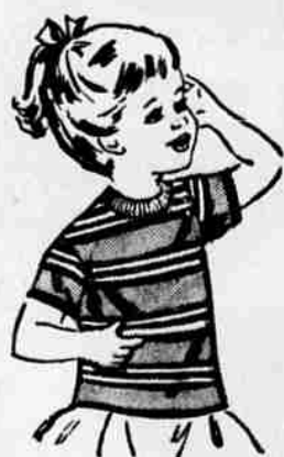
Tots' Combed Cotton Polo Shirts

Sturdy Sanforized twill crawler. Conventional snap crotch. Sizes 6, 12, 18 months.