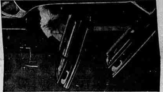
NEW FEATURES EVERYWHERE —New, convenient 2-stop safety front doors; new one-piece sweep-around rear window; new, super-safe, unified bumper-grille; luxuriously radiant new colors and fabrics, richest in Mercury history.