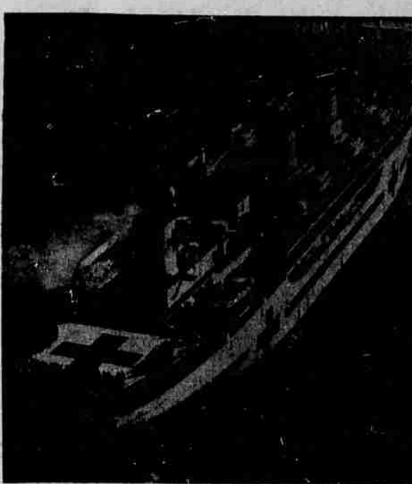
"Angel" Comes Home —The Navy hospital ship Repose, dubbed the "Angel of the Orient," is shown passing under the Golden Gate bridge as she enters San Francisco Bay. Crew members stand around her helicopter landing deck that permitted 884 emergency cases to be flown directly to the ship from the Korean battlefield in 28 minutes.

who at a later date may become members of the military service, and (3) To provide education of all students in becoming better citizens and in playing their parts in national security.