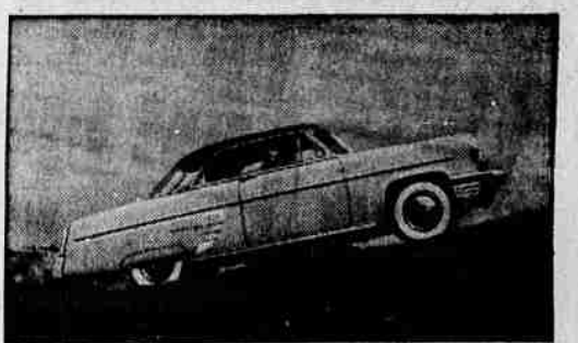
NEW PERFORMANCE —Proved V-8 performance, greatest in our exclusively V-8 history. And your choice of three great drives: silent-ease standard, economical Touch-O-Matic Overdrive*, and smooth, no-shift Merc O-Matic*. *Optional at extra cost

Just taste it! You'll agree it's... "Cheerful as its Name"