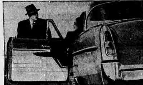
NEW YEARS-AHEAD STYLING —A cleaner, longer, lower look. No humps, no bulges. Parts are unified—inside and out—into larger, styled-together, work-together sections for greater beauty, better balance and better performance.