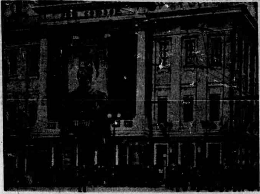
The line was 10 miles long!—Crowds line up outside the House of Unions in Moscow as grieving Russians pay their last respects to Josef Stalin, whose body lies in state in the Hall of Columns. A huge picture of the late Soviet dictator hangs from the front of the building.