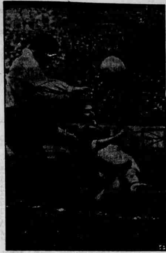
Foot Duel It's a matter of whose foot got to the ball first as Chelsea's Armstrong, left, and Birmingham City's Warhurst battle for position in a cup match at Chelsea, England.