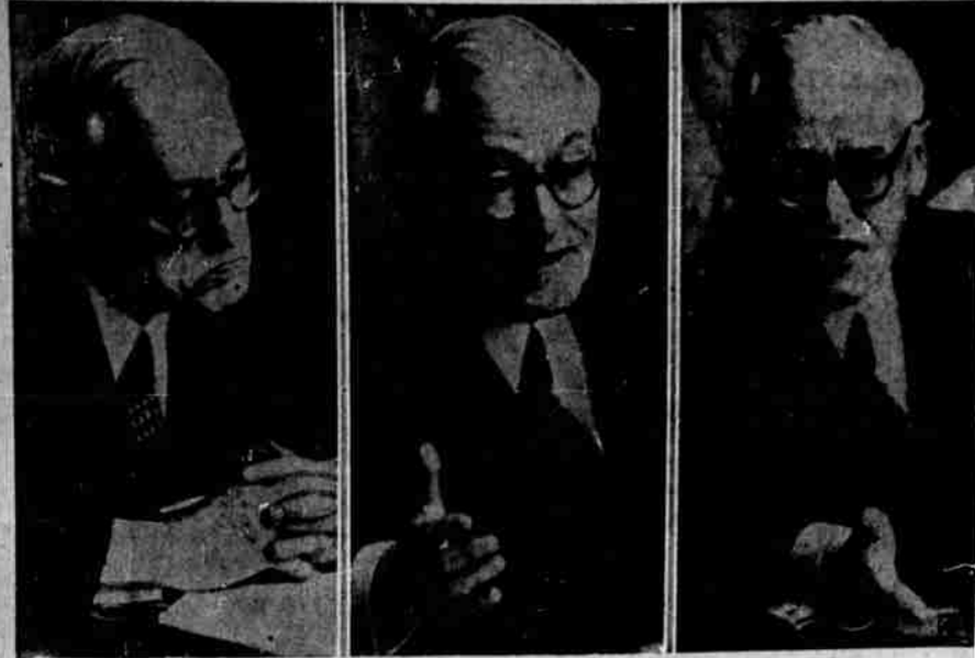
Truculent Vishinsky Hurls Accusations—Here are three studies of Russia's foreign minister Andrei Y. Vishinsky during his denunciation of the Republican administration before the United Nations 60-nation political committee in New York.