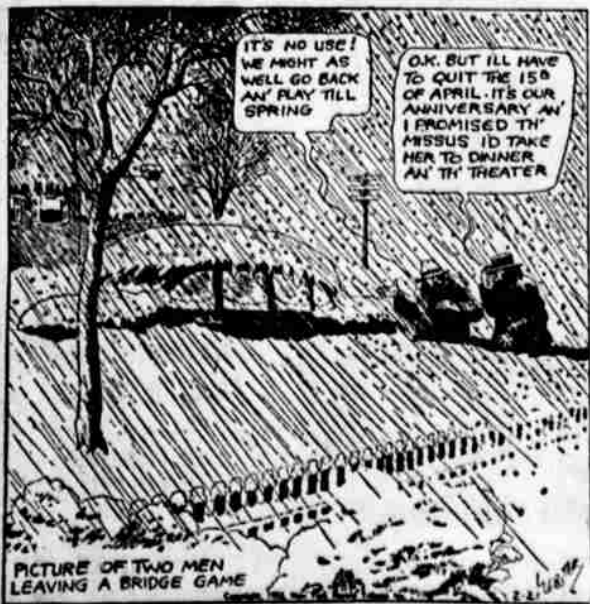
PICTURE OF TWO MEN LEAVING A BRIDGE GAME