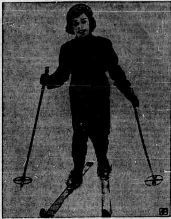
Royal Fun in Winter—Princess Christina of Sweden is all smiles as she gets ready for fun and frolic on skis at royal park in Stockholm after recent snowfall.

BEEBLE BOMBERS MEET — Fruitland — Fruitland's 4-H entomology club, "The Beetle Bombers," and the forestry club attended the monthly 4-H entomology meeting sponsored by Club No. 3 of Salem, at the First Christian church.