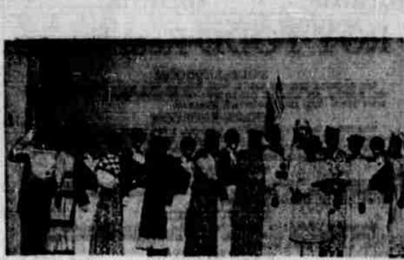
For Community Service —This is the minaret show troupe of the Salem Veterans of Foreign Wars, which will show at Fairview home Wednesday and Thursday nights of this week. The show will be given at Oregon State penitentiary February 13. The show is organized entirely for community service and not for financial benefit to any organization.