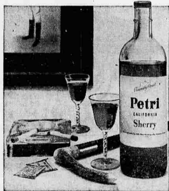
PETRI TOOK TIME TO BRING YOU GOOD WINE PETRI WINE CO., SAN FRANCISCO, CALIF.

"You picked a winner, Tom, when you picked Petri Wine!"