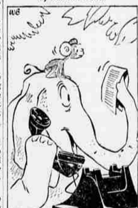
"It's a list of out-of-town numbers I call often. I haven't got the memory I'm supposed to have!"...A free booklet for listing your own long distance numbers is available at your nearest telephone business office... Pacific Telephone.