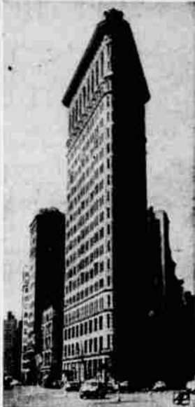
Schoolbook Landmark—The famous Flatiron Building.

It was built on a small triangular island on 23rd Street, where Fifth Ave. reluctantly crosses Broadway. It stands 280 feet high. It has frontages of 214.6 feet on Broadway, 85 feet on 22nd St., 197.6 feet on Fifth