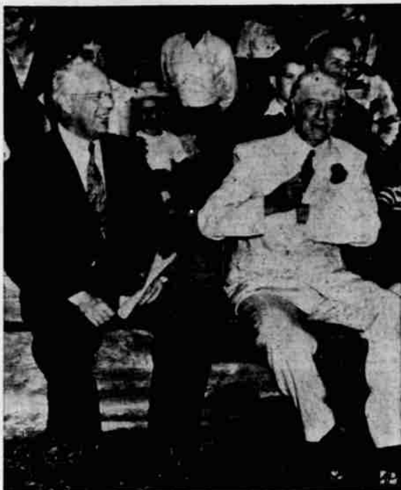
Bench for Baruch—Bernard M. Baruch (right) sits with California's Governor Earl Warren on a bench hewn from redwood log and dedicated at Dyerville, Calif., by the governor in honor of Baruch. The event took place on Baruch's 80th birthday. The bench is located in a redwood grove at the foot of a 364-foot tree.

Manila (AP)—Defense Secretary Ramon Magsaysay said Thursday a vast radar warning network, using equipment from the U.S., will be woven around the Philip-