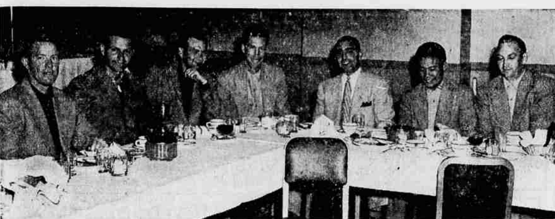
Solons Chow Down These seven veteran Senators were guests of the Salem Breakfast club Monday morning, just before the Salem team departed for Spokane, where the Senators open their Western International league season Monday. Left to right, third-