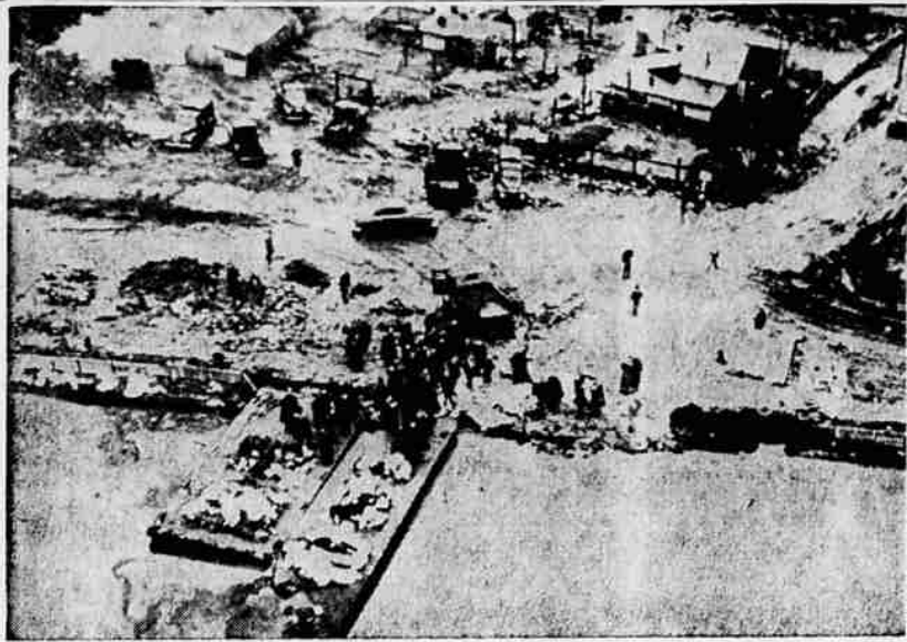
River Pounds Omaha Dikes—Army barges bring in sandbags to bolster the levee protecting Omaha, Neb., from the flooding Missouri river. Levee workers saw what white men never had seen before—the Missouri surging past at 30.22 feet. Rain turned the area into a sea of mud. (Telephoto.)