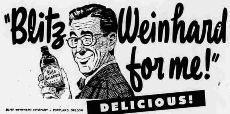
BLITZ WEINHARD COMPANY - PORTLAND, OREGON

have been three cases where humans have been kept alive for short periods with the aid of purely mechanical systems. But the Canadian work is the first in which the lung of an animal has been used as an experimental substitute for the lungs of a human. It works this way: Blood is pumped out of the patient's veins by means of a mechanical heart. The blood then is fed through the monkey lung, which is caused to inflate and deflate automatically. The lung takes in oxygen, which is then supplied to the blood. It also removes carbon dioxide from the blood. The blood ultimately is returned to the patient's body by means of a tube linked with an artery. Battle Casualties Washington (AP)—The defense department Monday identified 142 additional battle casualties in Korea in a new list. No 347 that reported 33 killed, 107 wounded, one missing and one injured.