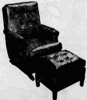
78.95 ROCKER AND OTTOMAN

$26 assortment of best-selling records at no extra cost with Airline 5-way combination, Static-free FM and standard AM radios plus 3-speed automatic record changer. Modern mahogany veneer cabinet.