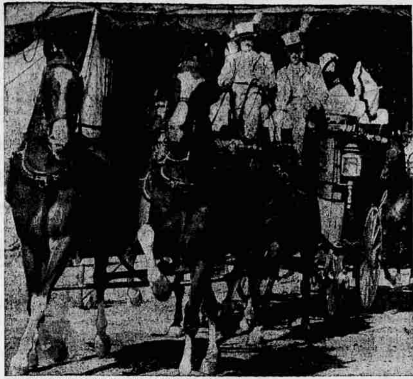
Smart Park Coach, with four-in-hand hitch of heavy harness Hackneys, in the superb equestrian production, "Picnic In The Park," featured by the Ringling Bros. and Barnum & Bailey Circus.