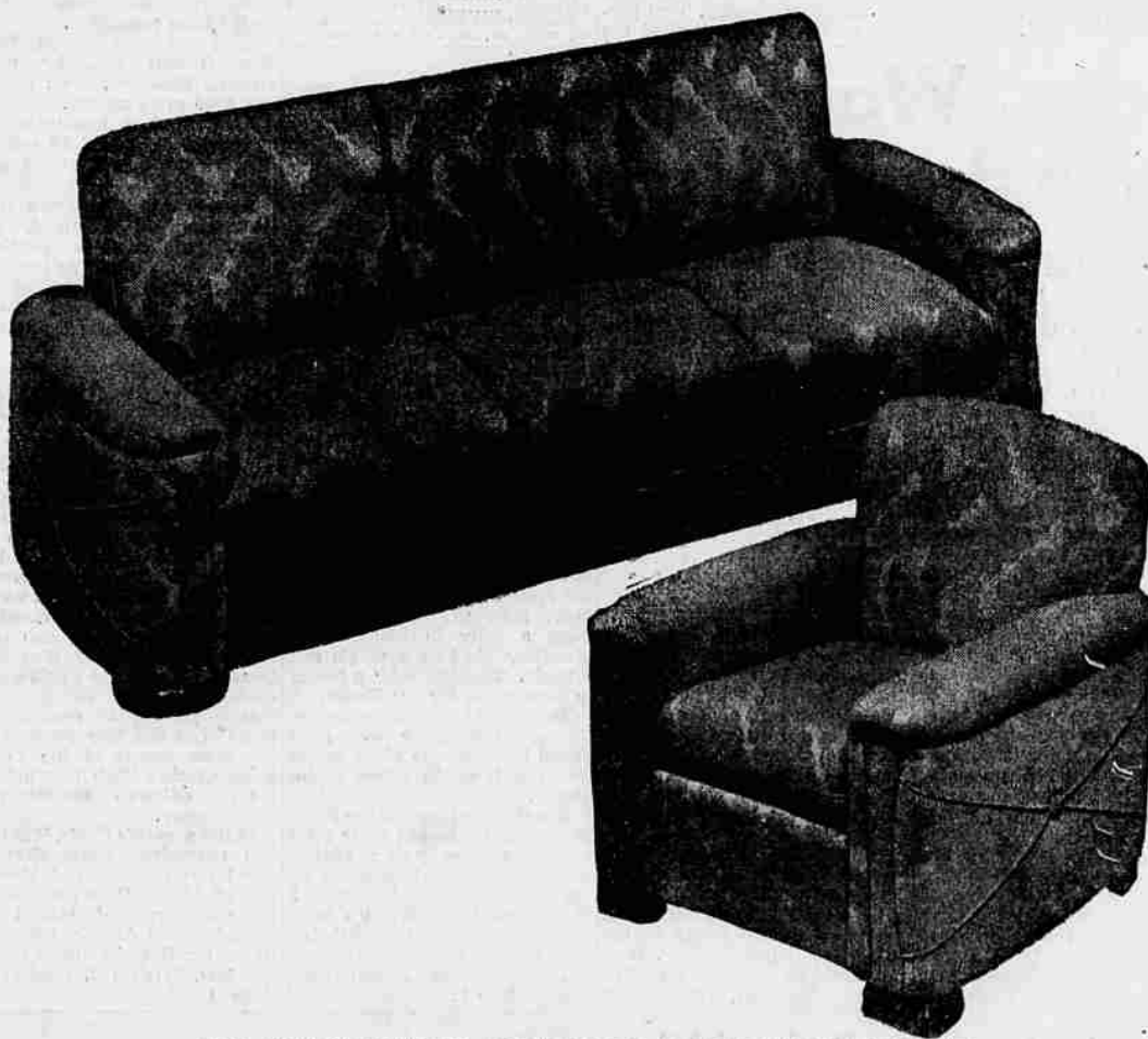
REG. 209.00 FIGURED FRIEZE 2-PC. MODERN SOFA BED SET