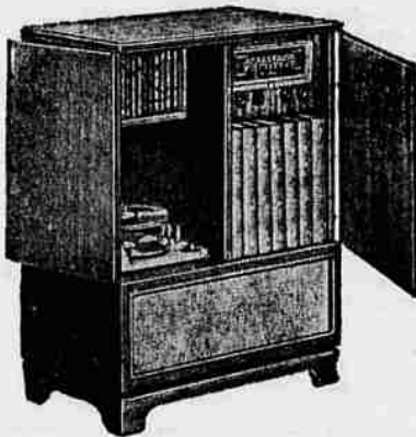
REG. 26 IN RECORDS

You will want lasting durability—and this suite gives you just that, strongly constructed throughout. At night the sofa opens into a restful spring bed for two. Large bedding compartment in sofa for storage of extra bedding. Reversible seat cushion in lounge chair, gives years of added wear.