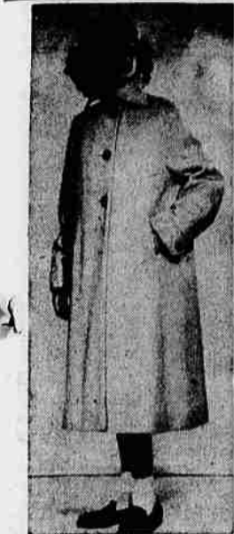
A smart fleece coat with winged stand-up collar lined with contrast velvet . . . button trimmed cuffed sleeves. Another coat "that grows" . . . pull the magic thread.

The OSS mission of Holohan, Lodolce and Icardi was to supply arms and ammunition to guerrilla bands fighting behind Nazi lines.