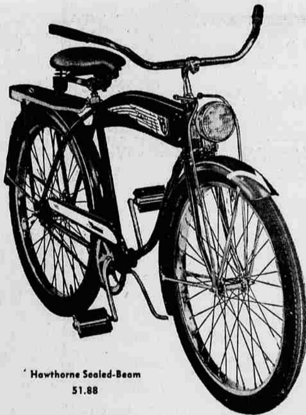
Hawthorne Sealed-Beam 51.88