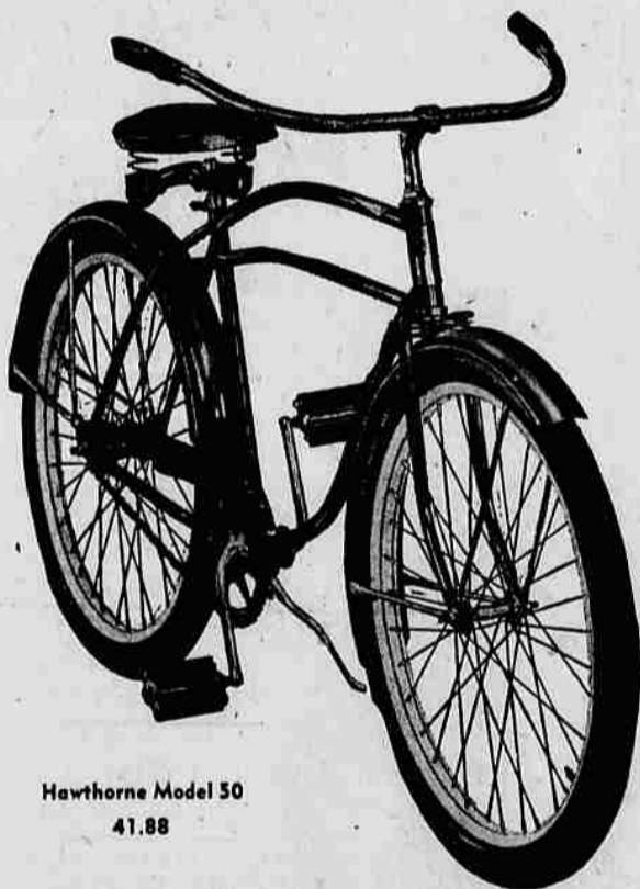
Hawthorne Model 50 41.88