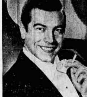
HIS MOVIES, HIS RECORDS, his concerts are sensational! Mario Lanza's great voice has carried him to the top and he plans to stay there! Mario smokes the cigarette that gets along with his throat—Camel! "Camels taste great and they're so mild!"

Can you identify these great American singers?