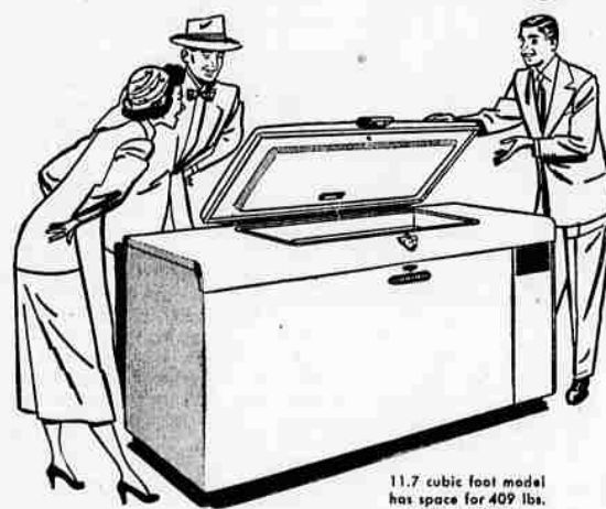
11.7 cubic foot model has space for 409 lbs. of frozen foods.