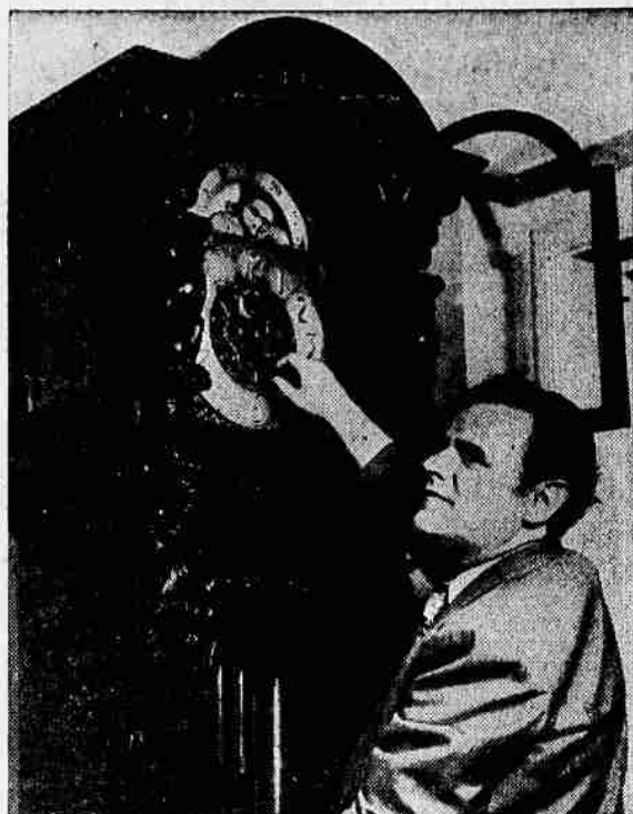
Alec Templeton, versatile pianist who will be presented in concert Saturday night by Associated Students of Willamette university in the high school auditorium.