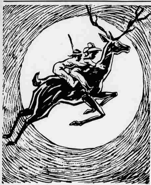
Lonesome Boy climbed up behind Bucky and Dasher sprang straightaway into the sky.