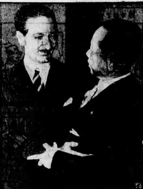
New and Old Assembly Presidents—Carlos P. Romulo (right) of the Philippines, outgoing president of the U. N. general assembly, congratulates his successor, Nasrullah Entezam of Iran, at opening of the fifth general assembly in New York City.