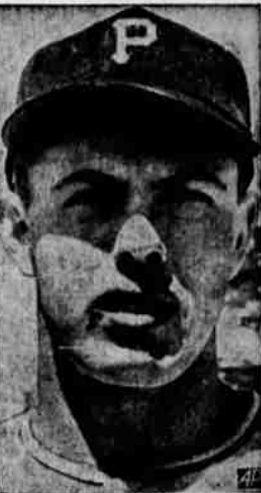
Wins Cliff Chambers (above) of the Pittsburgh Pirates yielded only four hits, all singles, in besting Warren Spahn in a pitching duel as the Pirates defeated the Boston Braves, 1-0.

Imperial is made by Hiram Walker. Blended whiskey. 86 proof. 70% grain neutral spirits. Hiram Walker & Sons Inc., Peoria, Illinois.