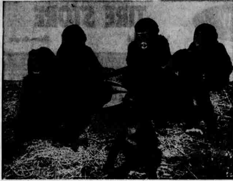
Where Do We Go From Here?—Seven baby gorillas, destined for zoos in various states, rest in a New York pet shop after a voyage by air from their native Africa.