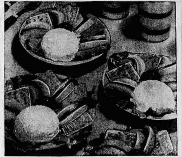
Dieter's Delight—Cottage cheese and rye wafers

(AP Newsfeature) There are lots of canned peaches around these days so why not try this fruit for spring-time meals? For a weekday or Saturday lunch team them with such nutritious and delicious dairy foods as cheese and milk—Papa, Mama, and the kids will be bursting with vitamins. I particularly like cottage cheese with the peaches, as shown in the salad pictured here, but cream cheese is delicious, too. For color contrast on your salad add strips of green pepper, a black olive and lettuce. For texture contrast serve with crisp rye wafers. If anyone in your family is dieting serve the salad without dressing, the cottage cheese "as is," and the crisp rye wafers without butter. For non-dieters add sour cream to the cheese, bring on a savory French dressing, pass the butter! For dinner-time dessert you might try doughnuts peach-Melba style. I like my doughnuts plain, but if you have a compulsion to fancy them up, combine doughnuts, ice cream, peaches and frozen raspberries for a quick Peach Melba. What to do with the syrup from the peaches after you've used the fruit itself in salad or dessert? Here's a recipe solution!