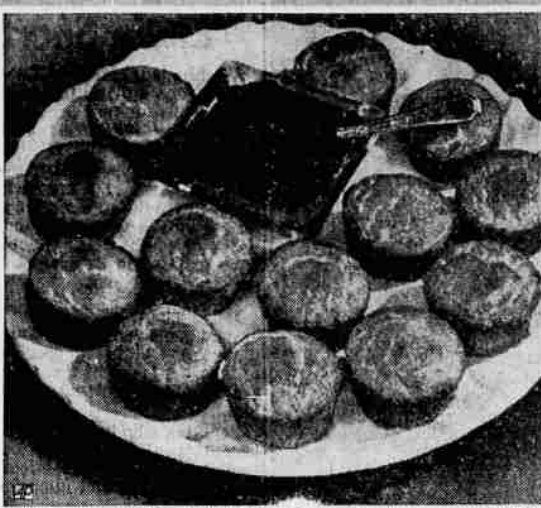
Jiffy Mix —Makes delicious muffins for those unexpected guests. Fine for breakfast, too. Try 'em with jelly.

Here's real help for Lenten meals—a homemade muffin mix that may be prepared when you have a little extra time and stored at room temperature for several weeks. Because the mix is an oatmeal one you'll find it will add ballast—from the point of view of nutrition and hearty appetites—to any Lenten meal. At a moment's notice you can bake any number of tempting hot muffins. Two cups of the mix, plus an egg and two-thirds cup of milk, makes about a dozen small muffins.