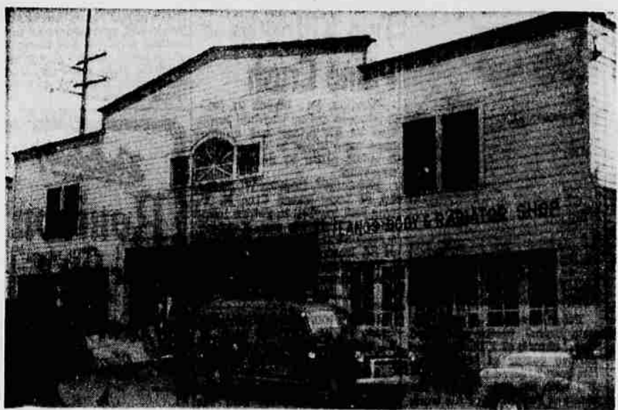
Horse and Buggy Barn Dismantled —Cherry City Feed barn, last feeding barn to operate in Salem, now being dismantled at 540-42-44 Ferry street to make room for a parking lot. Cherry City Feed barn housed about 200 horses and buggies on occasion but was never a livery stable.