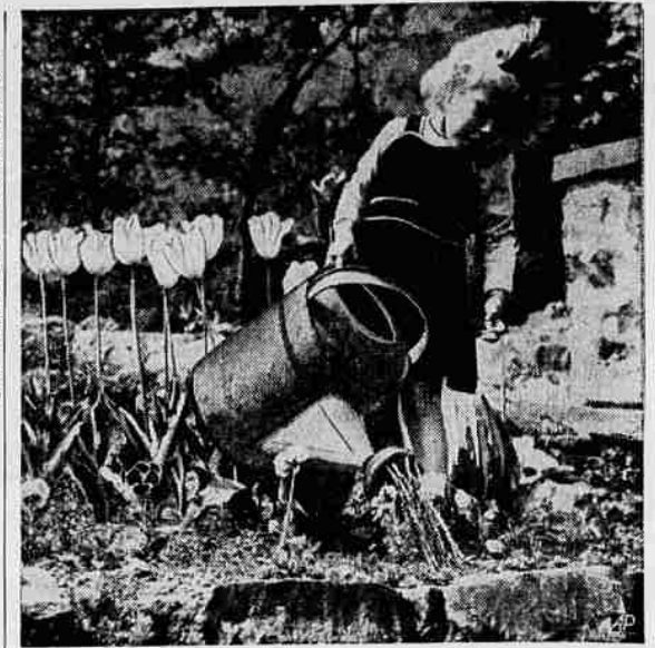
Tulips call for other flowers that will boom later

The important thing is to plan for succession of bloom, arranging plantings so there are always a number of different flowers showing their colorful faces. This is done by starting with the early spring bulbs and carrying through with the brilliant flowers and bright berries which survive the chilly nights.