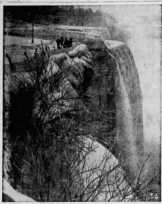
Winter Wonderland-Visitors to Niagara Falls brave a cold wind to view Prospect Point Gorge in winter dress from the Ice-crusted parapet alongside the American Falls.