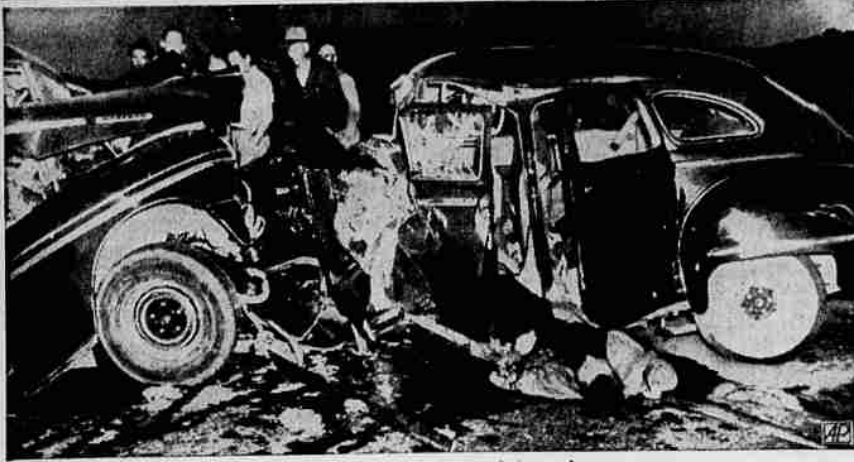
Four in Head-on Crash —Four men were killed and two injured in this head-on crash on a section of three-lane highway east of Hayward, Calif. Witnesses told the highway patrol the cars met when both moved into the center lane to pass slower vehicles.