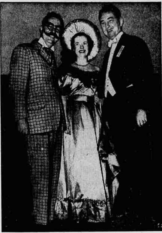
Southerners Reunion —Senator B. Russell Long and wife (left) of Louisiana meet Supreme Court Justice Tom Clark of Texas at Newspaper Women's ball, Washington.