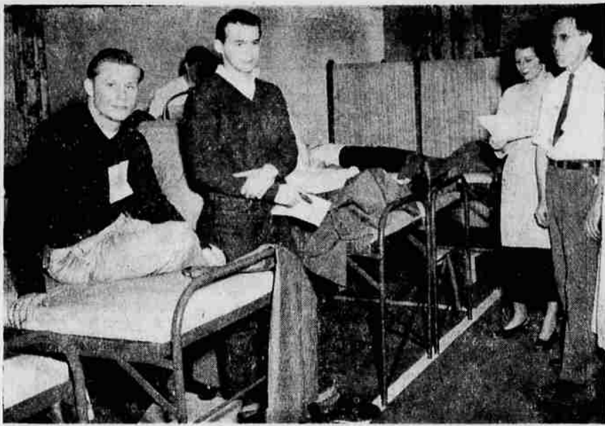
Students Donate Blood —It was "Willamette university day" when the mobile unit from the Portland regional blood center made its monthly stop here, Tuesday. Of the 135 pints of blood received, 83 were donated by Willamette students who were official sponsors for the unit for the day.