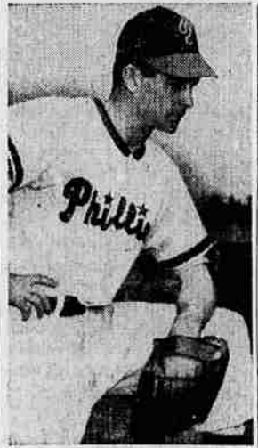
GRAN HAMNER Better than Reese?